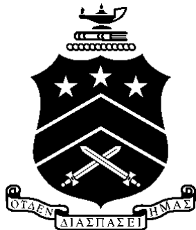
Coat of Arms (8 pts.)