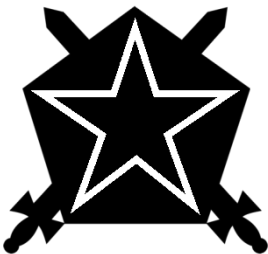
Star Shield (3 pts.)